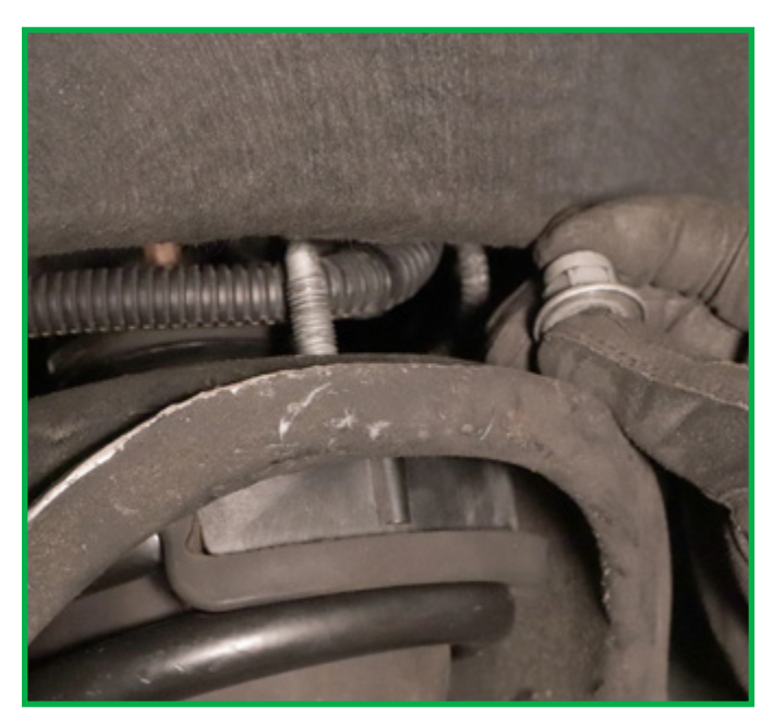
FIGURE 4 FIGURE 5