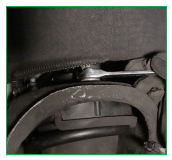
FIGURE 11 FIGURE 12

4. Reroute and connect the electrical connection. (Figures 13, 14)